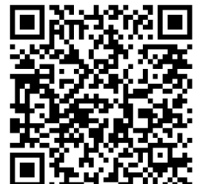
Food 4 Schools

Scan the QR code to the right to donate to this month's featured fund, the Food For Schools Project which helps stock area school food banks.